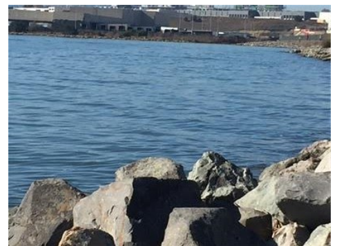
Picture of King Tides

https://storymaps.arcgis.com/stories/7bb45fa9eb834204bdb0c48170ab14e2.