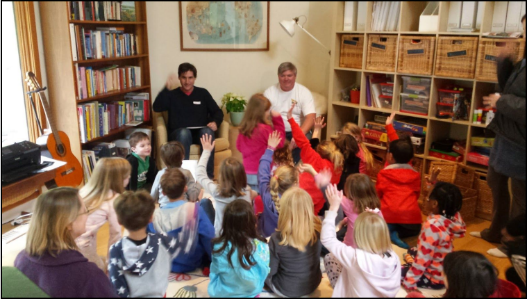
Beekeeping was the focus of the recent Beginning 4-H meeting.