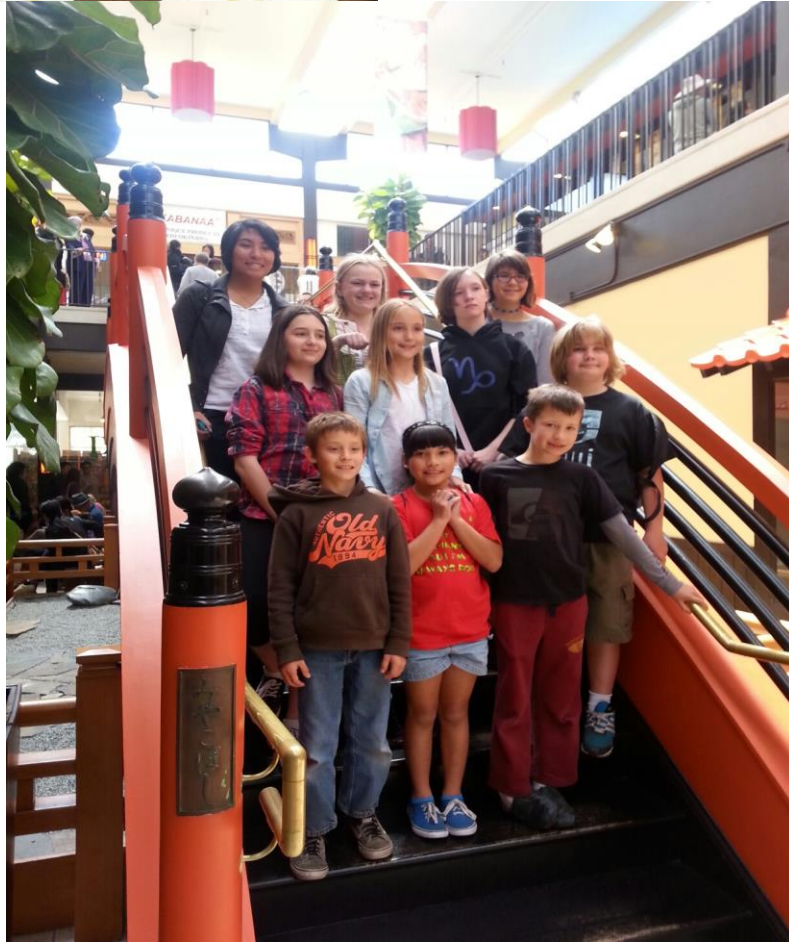
Manga Art goes to Japantown, San Francisco.