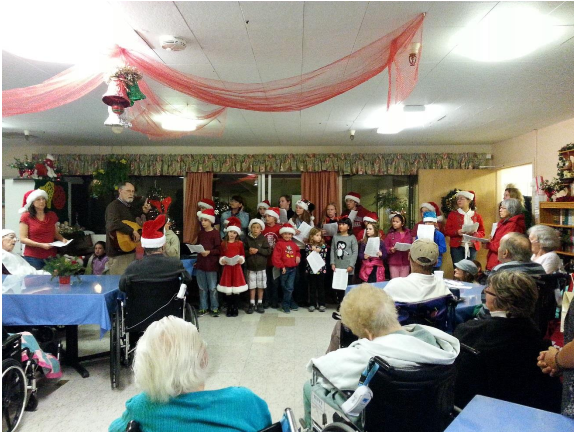
Carlmont Gardens Caroling